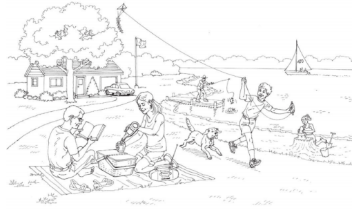
Figure 1: The images workers were asked to describe for the cookie theft (left) and picnic (right) picture description tasks.